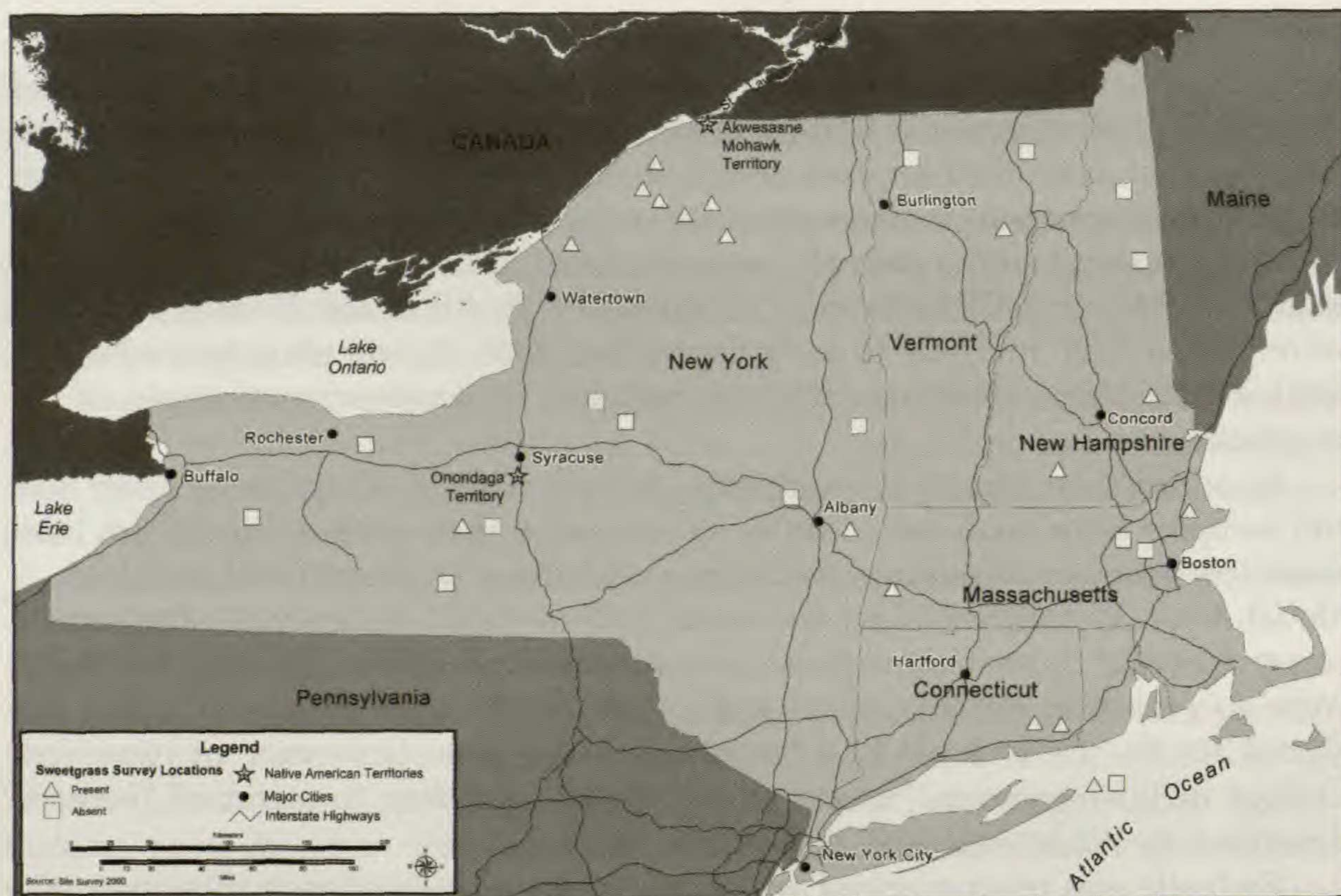
FIGURE 1.—The 32 sites that were visited throughout five northeastern states, five of which are/were Haudenosaunee sweetgrass gathering sites and 27 of which are sweetgrass sites of record.

tion coefficients and coefficients of determinations ( R^2 ) through correlation and regression. These data were analyzed using the SAS (version 7.0) Statistical Program (SAS Institute, Inc. 1990) with sweetgrass percent cover as the dependent variable.